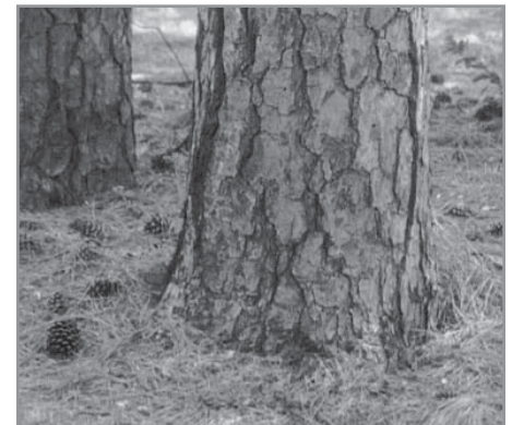
Nature's way of making compost mulch.

from Cowboy Trucking. I mulch vegetables when the plants are at least four inches high and I use about a three inch layer. However, you can not place mulch on beds that have been seeded, for this prevents the seeds from coming up. And it is best not to plant seed in mulch. ■