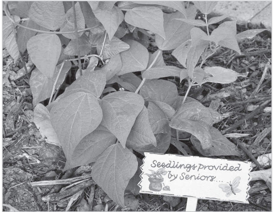
The community created at the Helping Hands Garden is multigenerational.