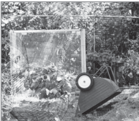
The backyard way of making mulch.

I am selective about what I use in the garden. Leaves and pine needles work for fruits and large ornamentals most